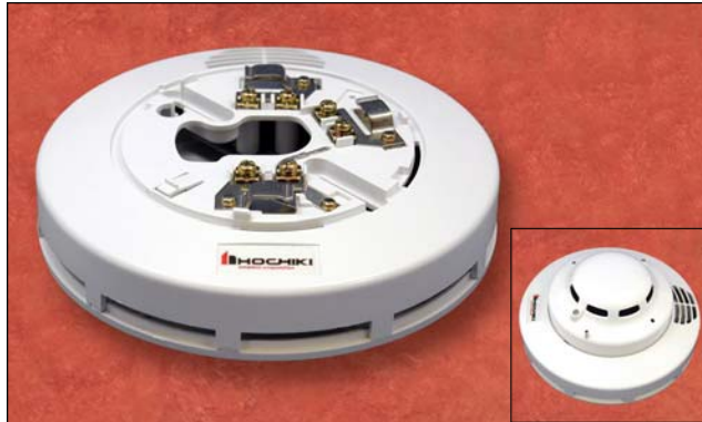
Shown without sensor